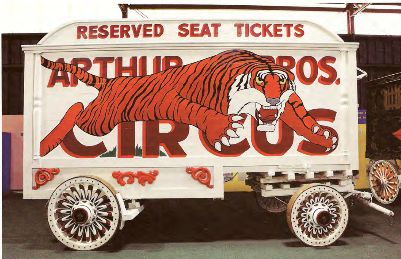
Circus World boasts the world's largest collection of circus wagons.

There are hills, valleys, creeks, rivers, and, of course, Devil's Lake."