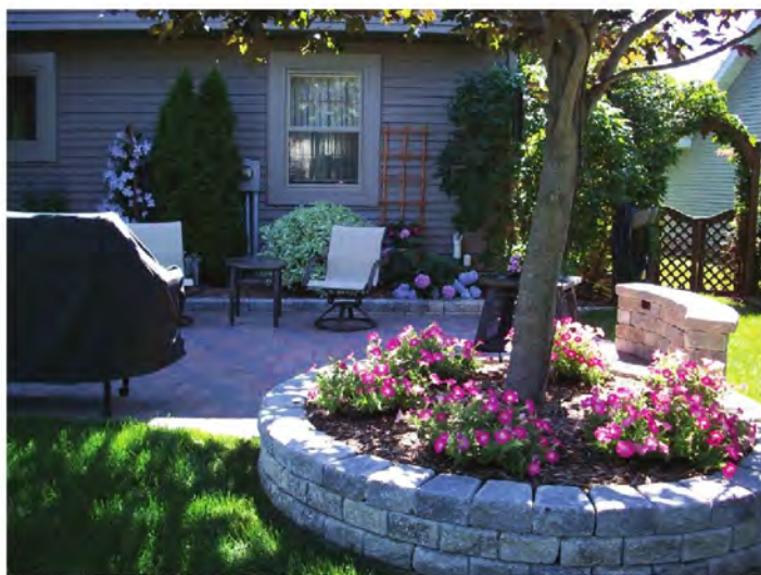
Just like inside your home, outdoor living space includes many elements.